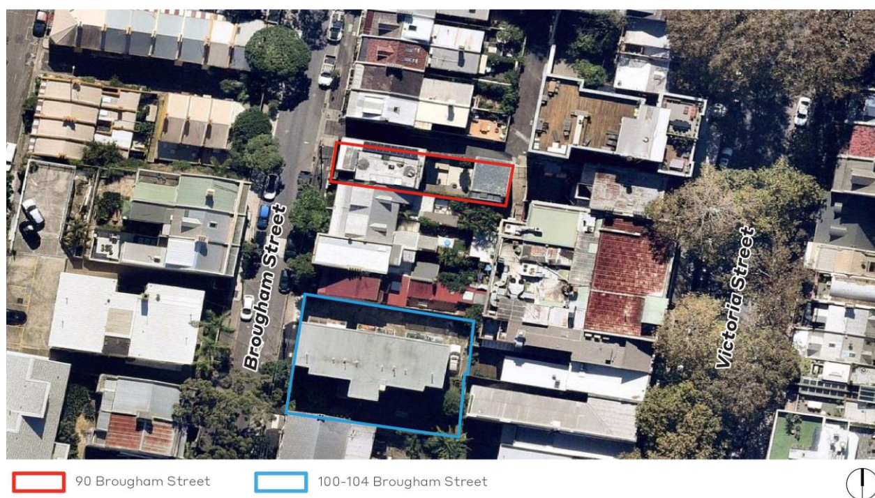
Figure 1 Aerial Photograph

90 Brougham Street, Potts Point is legally defined as Lot 15 Section 4 DP 28 and Lot 1 DP 456813. 100-104 Brougham Street, Potts Point is legally defined as SP 1560. An aerial photo of the sites is made available in Figure 1 .