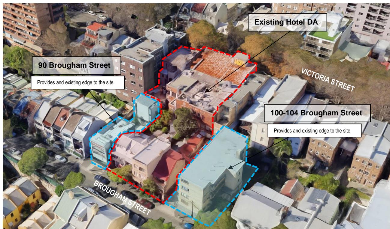
Figure 3 Perspective – looking generally north east